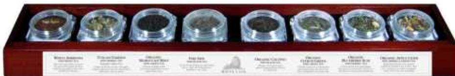
8-Tea Counter Display SUPC #8624597 (Natural Cherry finish shown)