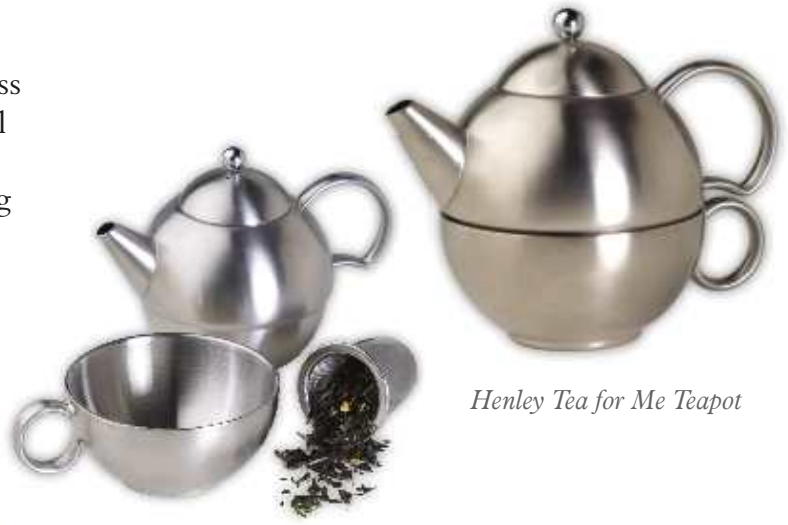
Henley Tea for Me Teapot