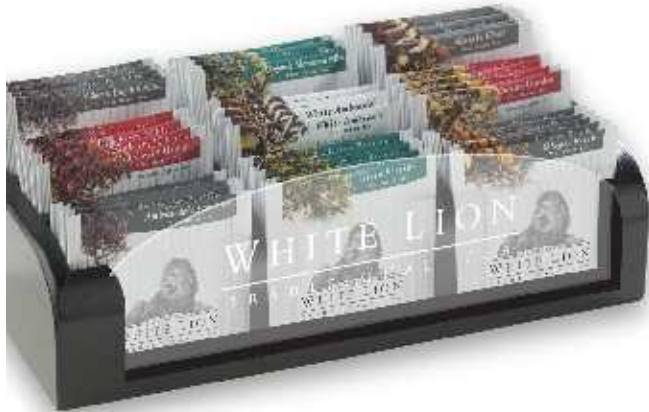
Presentation Chest SUPC #5496884

Presentation Chest with Initial Assortment. Includes 2 cases of each of the 9 blends of overwrapped teas. SUPC #5496937