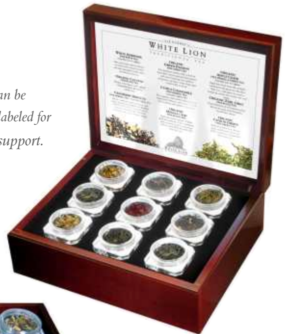
9-Tea Illuminated Butler Presentation Box SUPC #8230702

Inserted menus can be customized and private labeled for the ultimate in brand support.