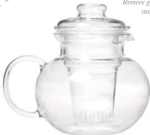
Bistro Glass Teapot

Remove glass infuser before steeping floret